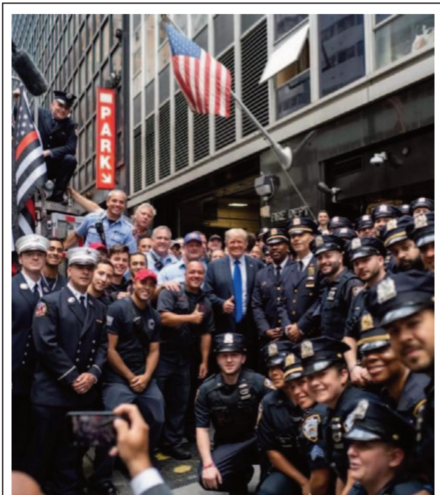
So awesome to see my father down with the great heroes from the NYPD and the FDNY on this somber day [9/11/2021]. Incredible group of men and women and it's not often that you see those guys I'll get together in a photo. Donald Trump creating unity amongst a great New York friendly rivalry. Thanks to all you first responders for all that you do.