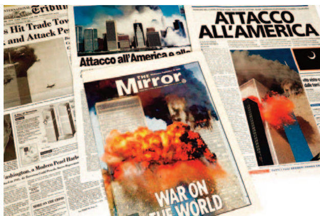
How far we have come since those heady post 9/11 days when the country stood united, even if only for a brief period of time.

On a single day, January 20, 2021, we went from being an energy independent nation to a dependent one, as Joe Biden, with the stroke of a pen, virtually shut down domestic energy production, while giving the green light to Vladimir Putin to complete the North Star pipeline from Russia to Western Europe. We are now reduced to begging the gulf oil states and even Russia, to increase their production so that we may begin importing from them. The signs are all unmistakable. The United States of America is slowly dying; the threads that hold us together as a civilization are slowly unraveling.