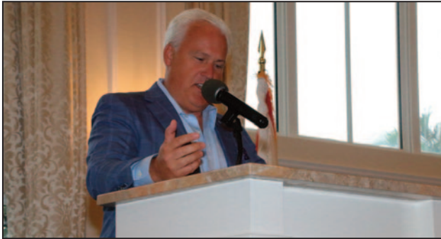
Matt Schlapp, Chairman of the American Conservative Union.