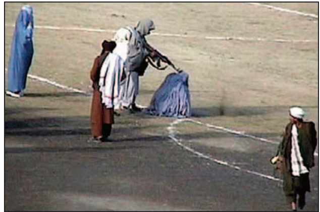
Taliban executing an Afghan woman.

President Biden and his Administration have caused tremendous damage to America's credibility and influence in the world. Biden's efforts to fulfill Obama's promise to end the U.S. superpower status and to downgrade it into just another country in the world will be difficult to reverse. Biden's 'gifting' of Afghanistan to the Taliban, especially on the eve of the twentieth anniversary of al Qaeda's attack on